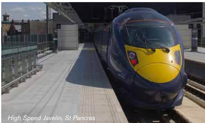
High Speed Javelin, St Pancras

A members' meeting was held on 16 March at the Rack & Tenter pub in the City of London, where ideas for the manifesto were brainstormed. It was agreed that there is a diversity of view within the Society on many transport planning questions that will feature in the General Election campaign, for example whether High Speed 2 should be a high priority or a low priority for available funds in the coming years, and the route it should take.